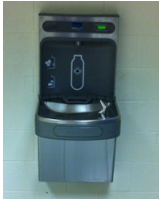
Water Bottle Filling Station